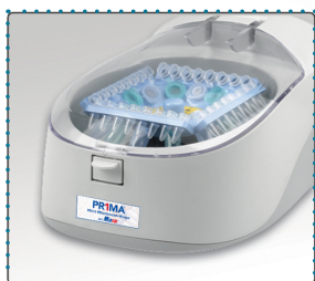
Compact, low profile design

Unlike traditional mini centrifuges, the PR1MA™ 12 eliminates the need to change rotors when switching between microtubes and PCR strips. The included, unique COMBI-Rotor™ is all that is required for running 12 microtubes and 4 PCR strips simultaneously.